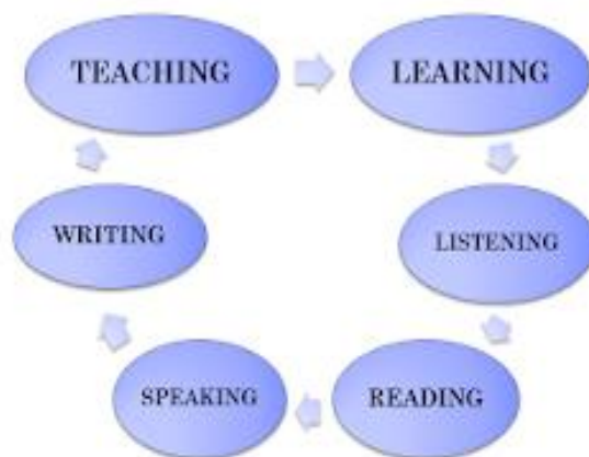
Figure 2. Language basic skills learning.

necessary to guide the student towards a self-taught attitude regarding vocabulary in order to enrich their learning. Similarly, it is necessary as a teacher to continue gaining experience in the four skills in order to maintain the acquired level of the language and improve the quality of teaching.