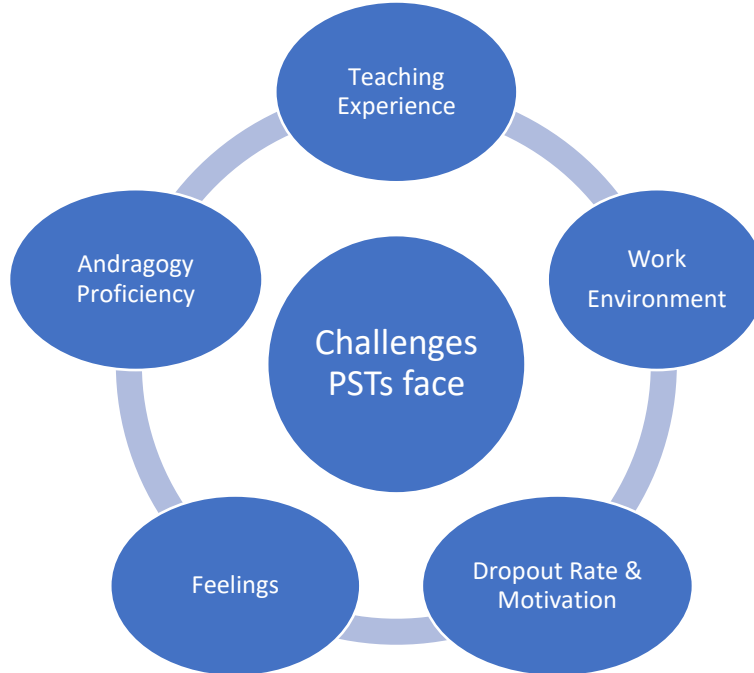
Fig 4. Challenges the participants faced